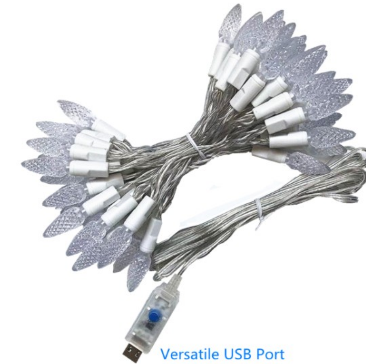
Versatile USB Port