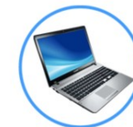
Computer USB Interface